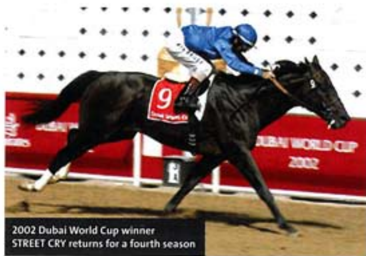
2002 Dubai World Cup winner STREET CRY returns for a fourth season

"World-class racehorses like Dubai Destination and Reset are two