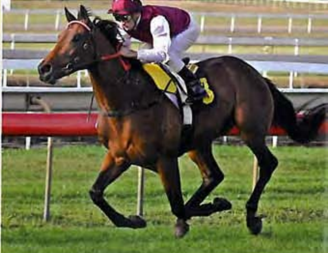
OCTAGONAL (left) joins RESET (middle) on the massive Darley roster; FRAVASHI (right) - one of the young talents in the Darley stable