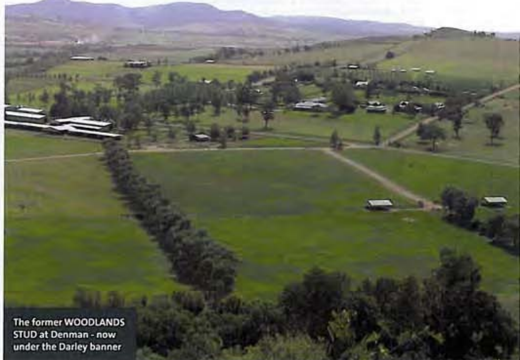
The former WOODLANDS STUD at Denman - now under the Darley banner